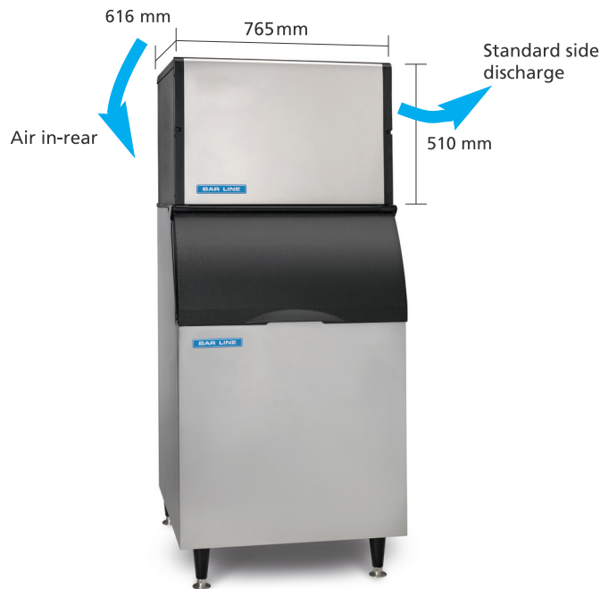
BM 305 AS on BIN 550